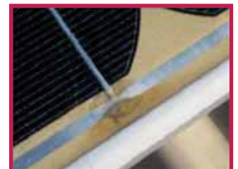
Yellowing and corroding panel