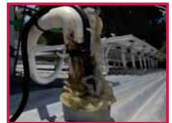
Poor installation quality

*From solar panel installation audit report, NSW Department of Fair Trading, pg 1